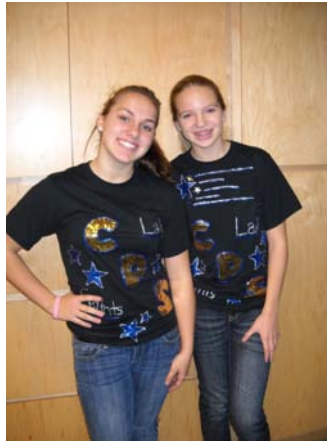
Spirit shirts were in full effect on Friday.