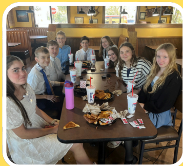
A select group of students were able to go to the Regional Science Fair! We are so proud of all of you!

Catholic Trivia: Did you know that the Feast of the Chair of St. Peter celebrates Peter as the head of the Apostles and the pope as the head of the Church?