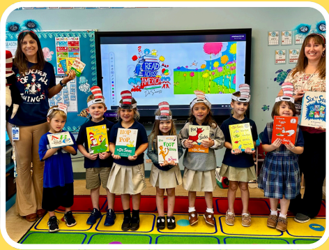
VPK celebrated Dr. Suess' birthday!