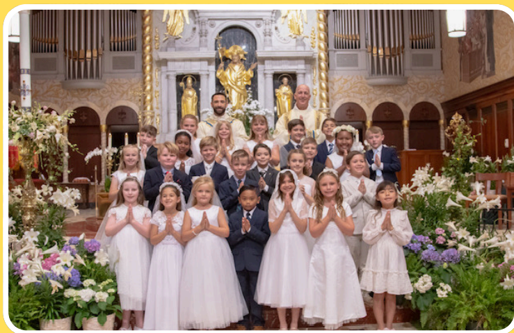
2nd Graders received their First Communion at the Cathedral!