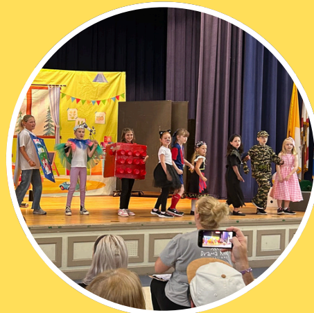
Drama Kids had their performance!