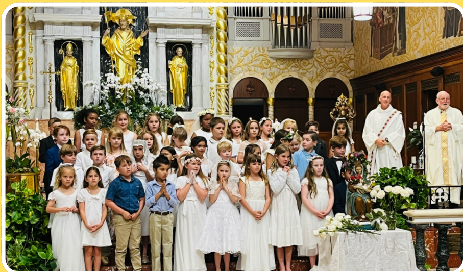
2 nd Graders honoring Mary for May Crowning at Mass!

We, the Catholic Community of Cathedral Parish School, will be examples of Christian teachings, will serve others as Jesus would, will achieve academic excellence, and put Christ first in ALL we do.