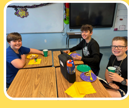
Mardi Gras Festivities